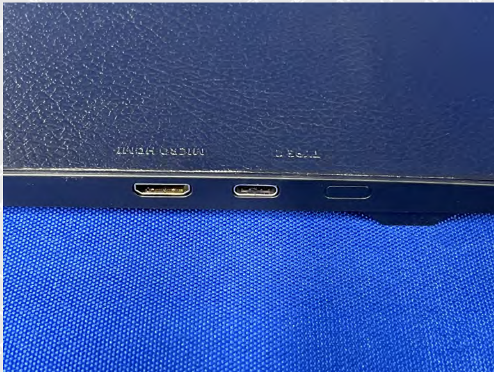
Fig. 4 I/O Ports