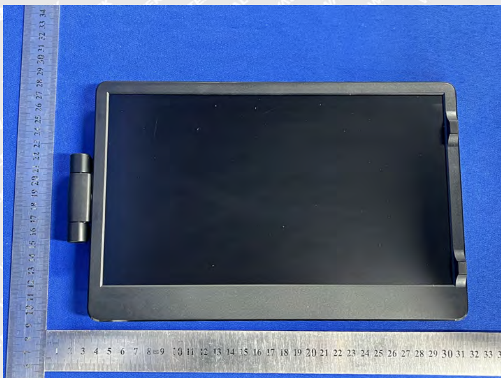
Fig. 2 Front View