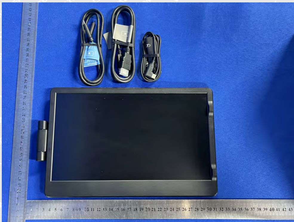
Fig.1 Front View